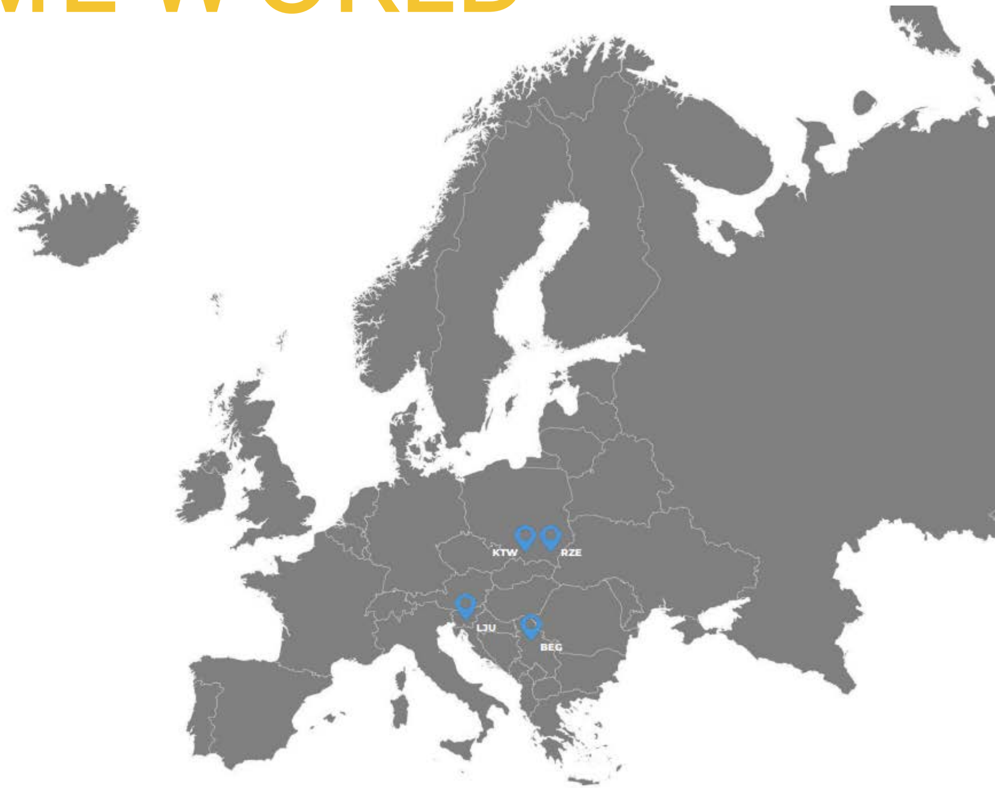
Avia Prime bases

From 2019, JAT Tehnika is owned by the Avia Prime Group , an eminent organization specialized in aircraft maintenance, which besides JAT Tehnika , also consists of the following MRO's – Linetech (Poland) & Adria Tehnika (Slovenia) .